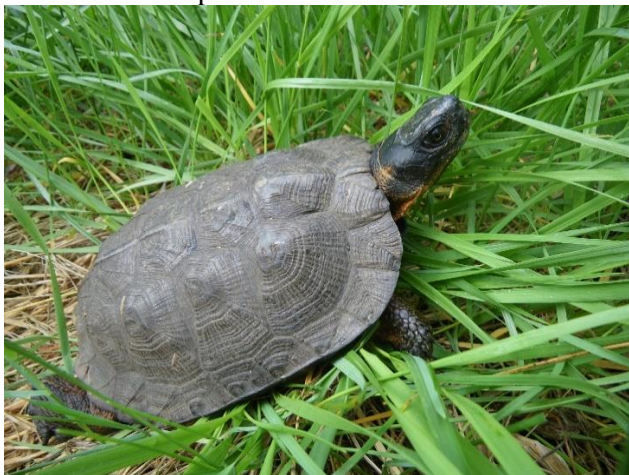
Wood Turtles' shells look like wood.

Vernal Pools and Rare Animals - Foxborough is home to countless vernal pools and several State-listed rare animals, including turtles (Blanding's, wood and box), marbled salamanders, and fresh water mussels. Please visit the Commission's website for more information and also see Chapter 4 of the OSRP.