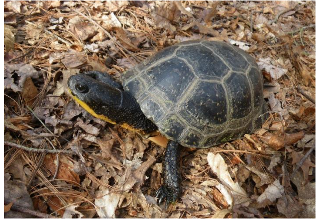
Blanding's turtles have yellow necks.

If you happen to find a rare animal, plant or insect in Foxborough, please take photos ( please don't touch ), call Jane Sears Pierce as soon as possible (508-543-1251), and send her your photos (including your name, date and location). This important data will help us to protect the Town's (free) natural assets. Thank you!